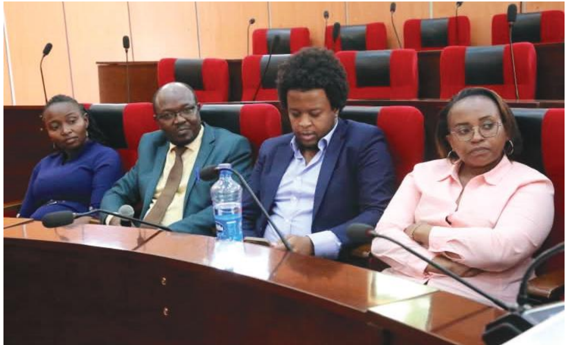
KMPDU kiambu county branch officials following through a Kiambu county assembly committee on health meeting to address the doctors strike

The fate of Kiambu's health system and thousands of its patients now hinges on whether negotiators can bridge the final gap over a single clause—a bitter testament to how political brinkmanship can paralyze an essential public service. The union, signaling an escalation, has announced plans for public demonstrations to draw attention to their grievances and the rising death toll.