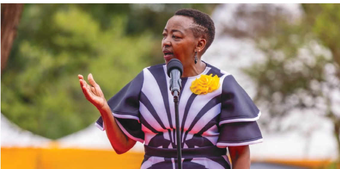
First Lady Rachel Ruto

The service also helped raise more than Ksh.4 million that will be used