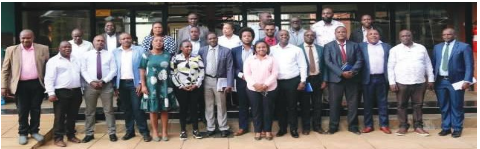
County Assembly Committee on Health Services, the Kenya Medical Practitioners, Pharmacists and Dentists Union (KMPDU) officials and the County Executive Department of Health pose for a photo outside the county assembly precincts.