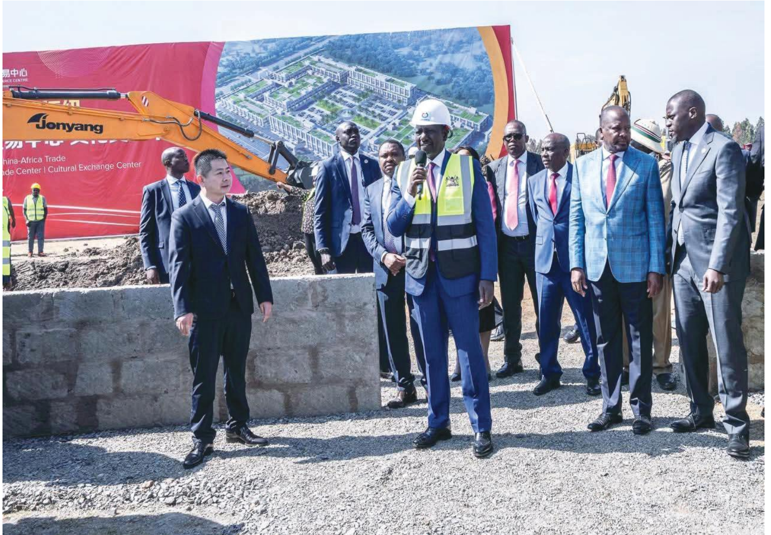
President William Ruto making an address after laying the foundation stone for the China-Kenya International Commerce Centre; a KSh5 billion landmark mixed-use development project at the Jamhuri Showground in Nairobi yesterday.