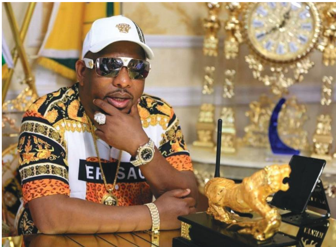
File image of former Nairobi Governor Mike Sonko.

He dismissed the case with costs and ordered that the money preserved under an interlocutory order issued in February 2020 be released to Sonko forthwith, unless otherwise lawfully held.