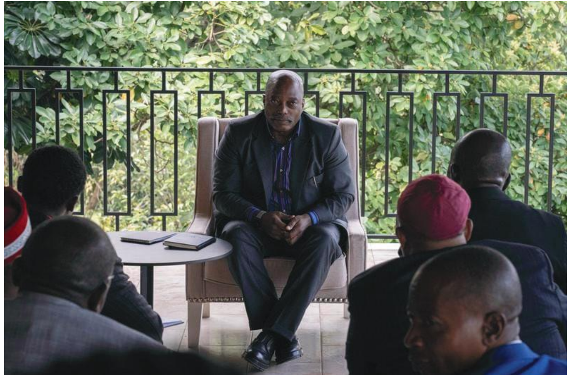
This file photo taken on May 29, 2025 shows Joseph Kabila (C), former president of the Democratic Republic of the Congo (DRC), meeting local personnel in Goma, North Kivu Province, the Democratic Republic of the Congo.

by the Senate in May, was conducted without the presence of the accused. The prosecution accused the former head of state of being implicated in atrocities committed in the eastern provinces by the M23. Evidence presented included witness testimonies, video footage, and media interviews. Since January, the security situation in the eastern DRC has sharply deteriorated, with renewed fighting involving the M23, which has seized control of several strategic areas, including Goma and Bukavu. Kabila, who ruled the country from 2001 to 2019, has been residing primarily in South Africa since 2023. Since May, he has made public appearances in the DRC's eastern province of North Kivu. He also expressed his desire to return home to "contribute to finding a solution" to the ongoing crisis.