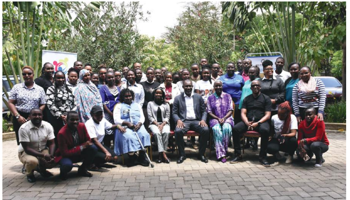
Some of those who attended the training on gender and women empowerment at Nanyuki Laikipia County.