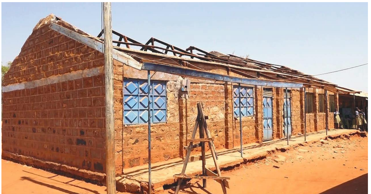
Part of the classrooms that were destroyed.

As leaders, we cannot stand by and watch our young people's education being disrupted by activities that put their safety and future at risk," Mundigi warned.