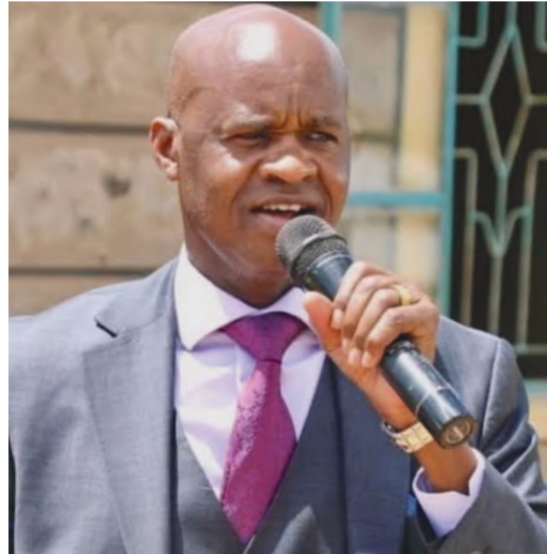
Senator Alexander Mundigi

Meanwhile, Mundigi also cautioned parents in the area against allowing their children to engage in sand harvesting, which was the main economic activity in the region, warning that the illegal activity was robbing minors of education and endangering their future. †