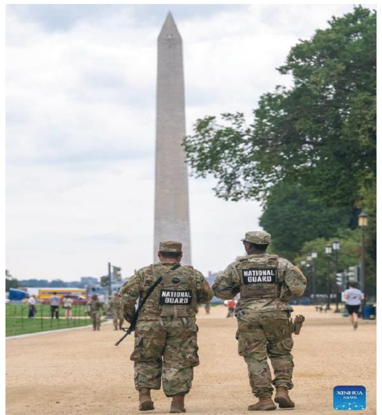
Members of the National Guard patrol in Washington, D.C., the United States, Sept. 4, 2025.

pressing key sectors such as restaurants, hotels and tourism. The Trump administration countered that the deployment has helped drive down violent crime in the district.