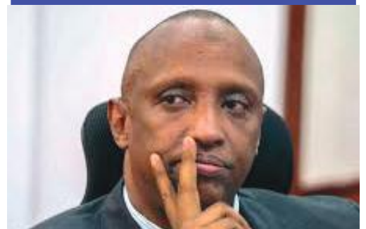
News: DPP Orders Arrest Of Isiolo Governor Abdi Guyo Over Kidnapping, Assault P.13

NAIROBI INTERNATIONAL DIGITAL CONFERENCE,