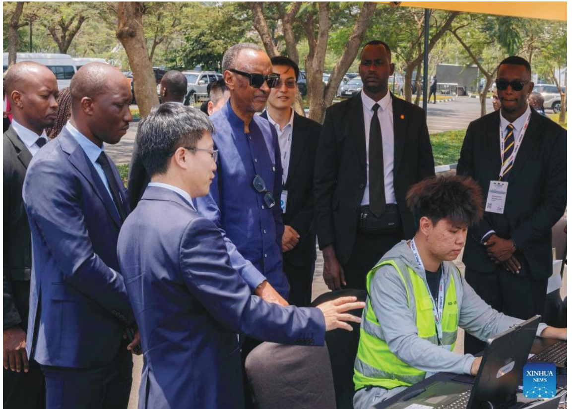
Rwandan President Paul Kagame (4th L) watches an aircraft demonstration at EHang booth during the 9th Aviation Africa Summit and Exhibition in Kigali, Rwanda, on Sept. 4, 2025..

Alan Peaford, chairman of the Africa Aviation Summit, noted that poor intra-African connectivity, operational inefficiencies, and slow adoption of international standards are holding Africa back, but emphasized that these challenges can be resolved with collaboration. Kagame also toured the exhibition, which features up to 100 exhibitors showcasing their contributions to the continent's aviation growth. The two-day summit, which concludes on Friday, is being held under the theme, "Collaborating to unlock Africa's growth -- How can Africa deliver a sustainable aviation industry?"