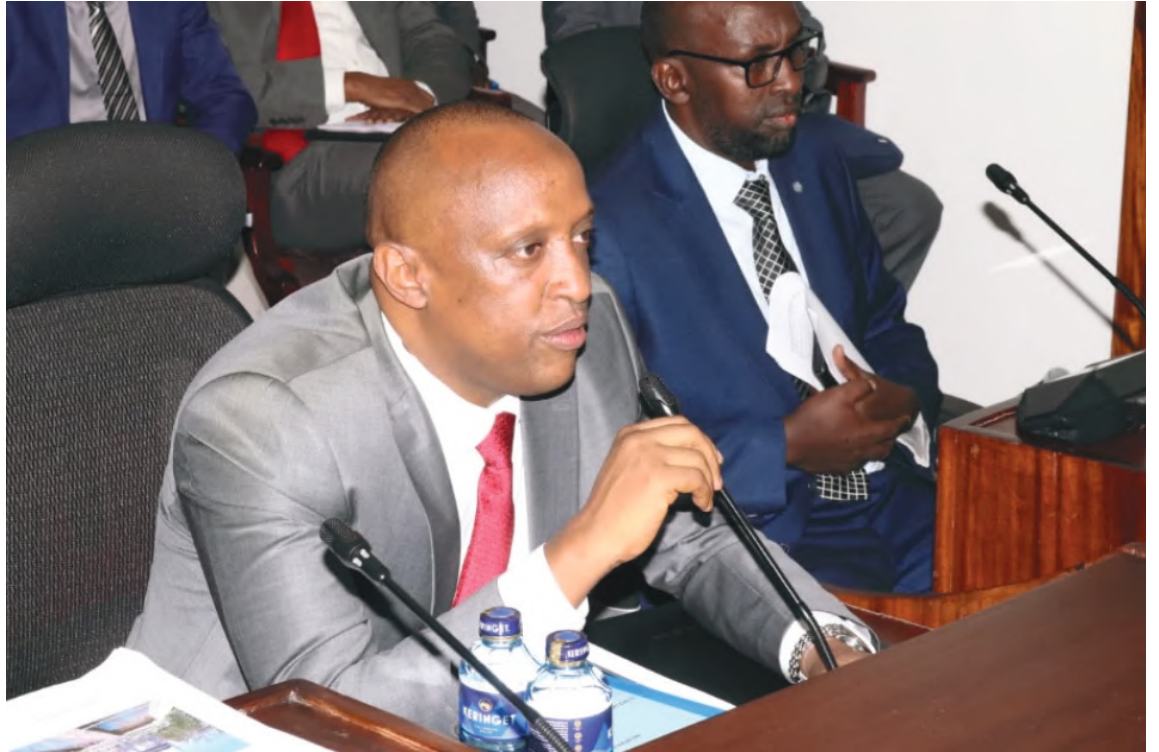
Isiolo Governor Abdi Guyo appears before the Senate Committee on County Public Investments and Special Funds on May 15, 2025.

The DPP has ordered that the suspects be arraigned to face charges of kidnapping with intent to cause grievous harm and robbery with violence.