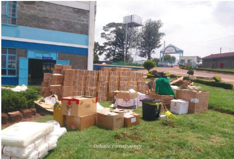
Some of the equipment and machines outside Mwai Kibaki Level VI hospital's main building.