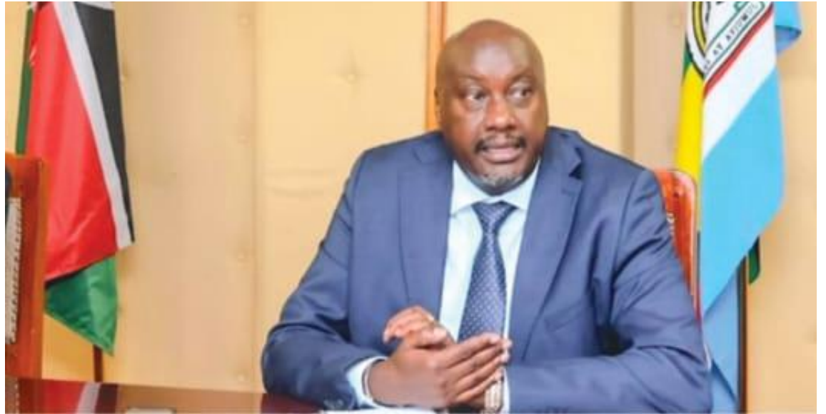
The Deputy Head of the Public Service, Amos Gathecha

Gathecha further noted that MSP will not only balance economic growth with environmental protection, but also strengthen food security, national resilience and tourism attractiveness by safeguarding marine biodiversity.