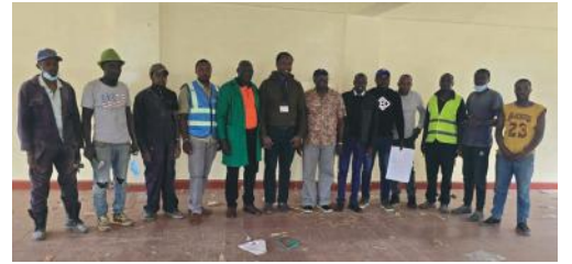
Politics: Installation Of MRI And CT Scan Machines At Mwai Kibaki Hospital Begins P.11