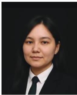
By: Nilufar Mo'yidinova @themtkenyatimes