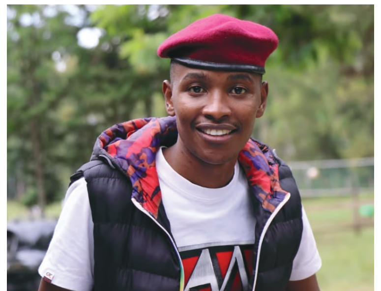
File image of Kikuyu musician Samuel Muchoki, popularly known as Samidoh.

Through her lawyers, Kaaya Momba & Company Advocates, the petitioner is seeking urgent orders directing police to register and investigate her case, preserve her evidence, and instruct the Attorney General to initiate mutual legal assistance with U.S. authorities to obtain certified police and prosecutorial records.