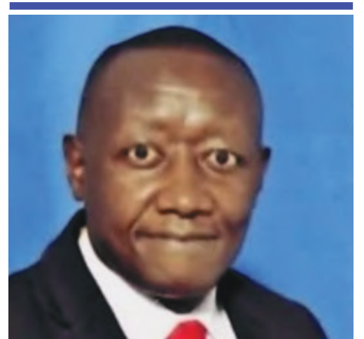
Opinion: Reimagining Capitation: Sustainable And Innovative Funding Solutions For Kenya's Public Education System P.12