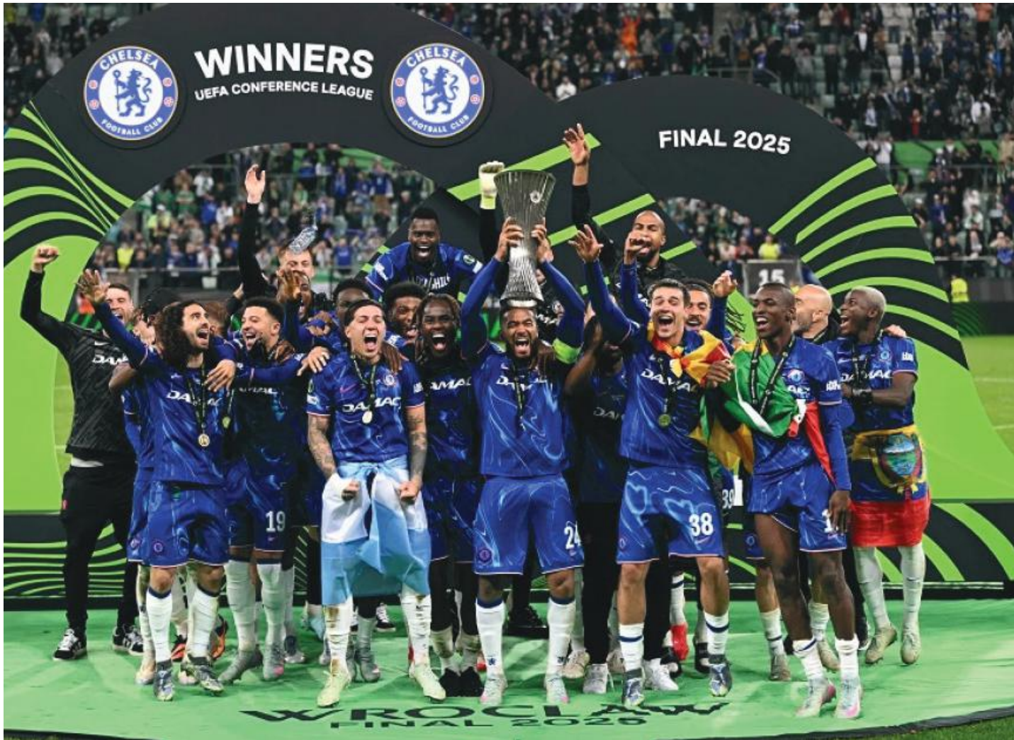
Chelsea's players celebrate with the trophy after the UEFA Conference League final football match between Real Betis and Chelsea FC in Wroclaw on May 28, 2025.

Chelsea were charged by the Football Association yesterday with 74 alleged breaches of rules related to payments to agents between 2009 and 2022. The FA said the charges primarily relate to the period between the 2010/11 and 2015/16 seasons. The Premier League club has until September 19 to respond. Russian oligarch Roman Abramovich transformed Chelsea's fortunes after buying the west London club in 2003. He sold the Blues in May 2022 to a consortium led by American investor Todd Boehly and private equity firm Clearlake Capital. Chelsea issued a statement saying the club were "pleased to confirm that its engagement with the