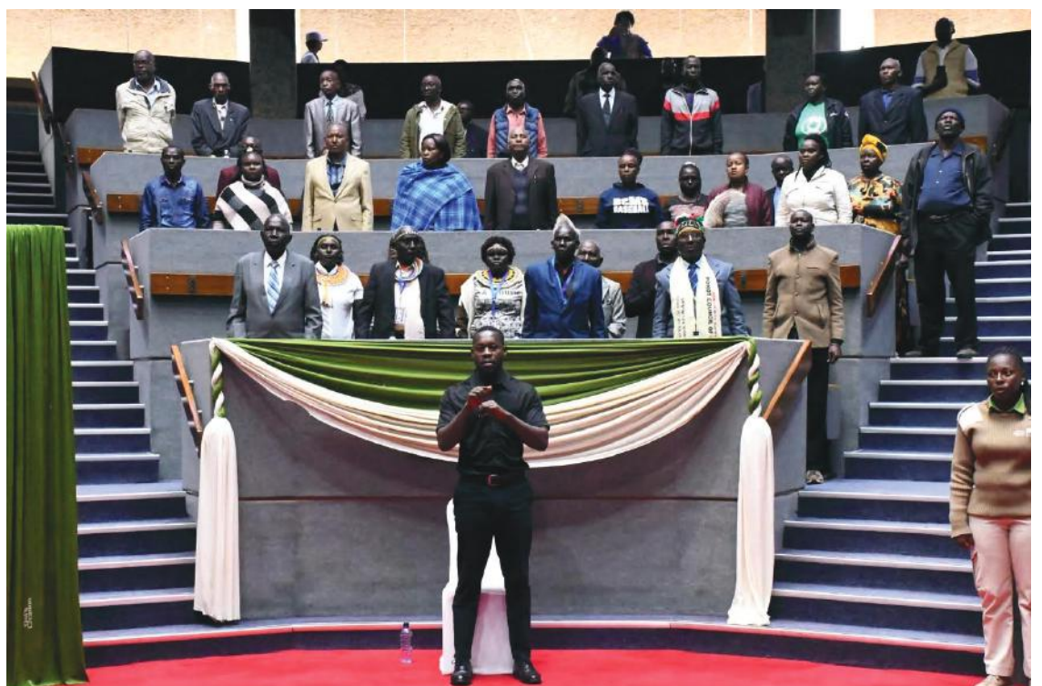
Some of the people who attended the KWS validation forum at KICC.

Today, more than 2,000 of their members from Murang'a County are expected to join other leaders from the area who are visiting State House, Nairobi to meet President William Ruto where they are expected to raise the issue of their compensation.