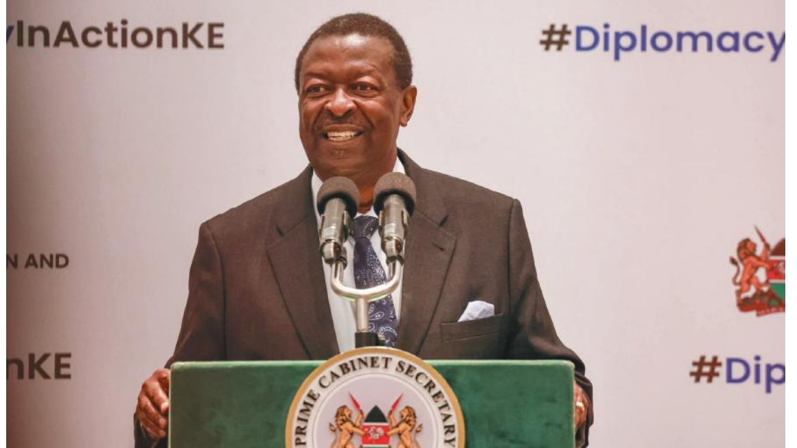
Prime Cabinet Secretary Musalia Mudavadi

entrench the rule of law, strengthen Mudavadi briefs diplomats on Kenya's foreign policy, economic reforms and peace efforts.