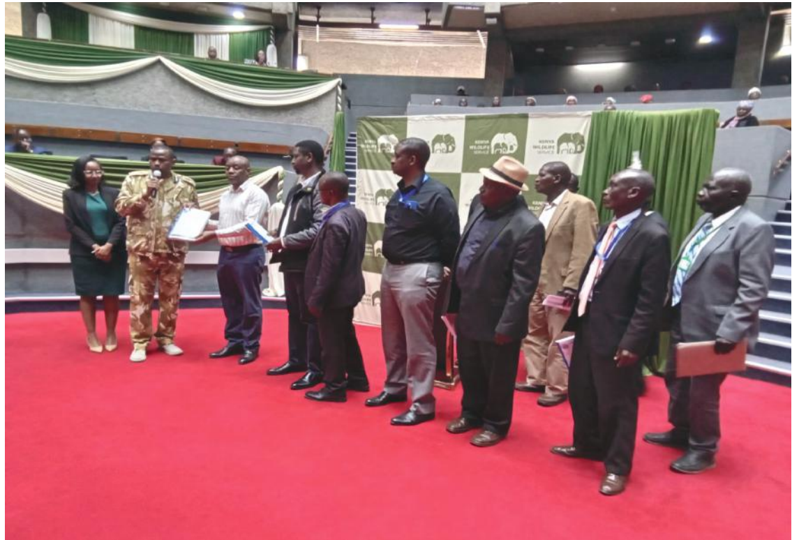
Some Mau Mau War Veterans Association members preparing to present a petition.

Members of former freedom fighters caucus, Mau Mau War Veterans Association said they would get a chance to freely return to where they