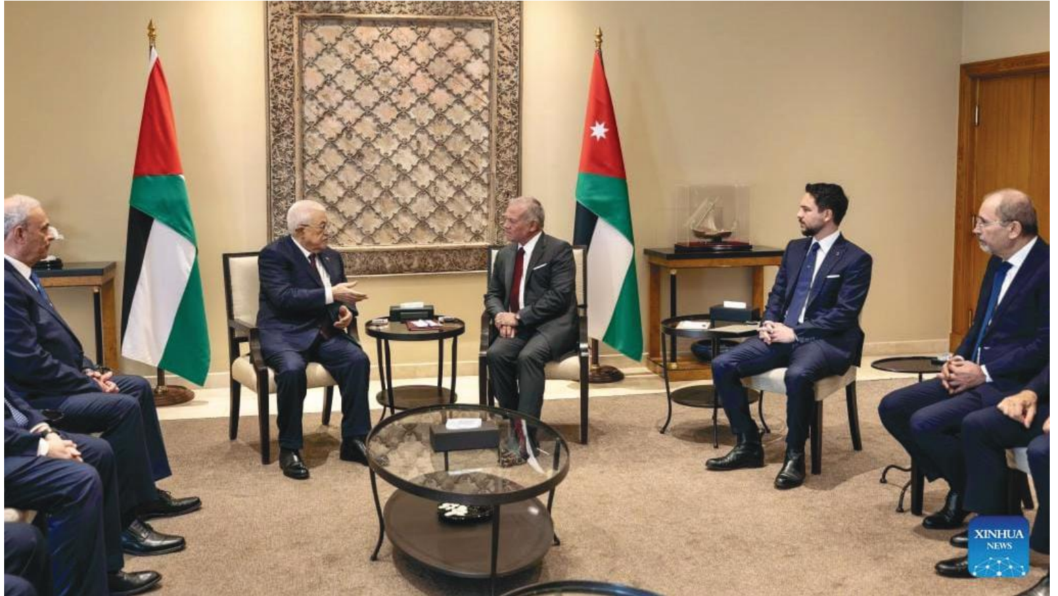
Jordan's King Abdullah II (C) meets with visiting Palestinian President Mahmoud Abbas (2nd L) in Amman, Jordan, Sept. 10, 2025. During his meeting with Abbas on Wednesday, King Abdullah II condemned the Israeli Doha strike, rejected Israeli plans to expand control over Gaza and settlement activity in the West Bank, stressed the need for a ceasefire in Gaza and unhindered humanitarian access, and for implementing the two-state solution, according to a Royal Court statement.