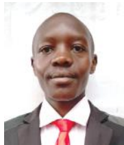
By: Gitaũ wa Kũng’ũ @themkenyatimes

In the waning days of harvest, as Murang’a’s hills turn gold and the air carries the scent of drying maize, a date approaches that is more than a square on the calendar.