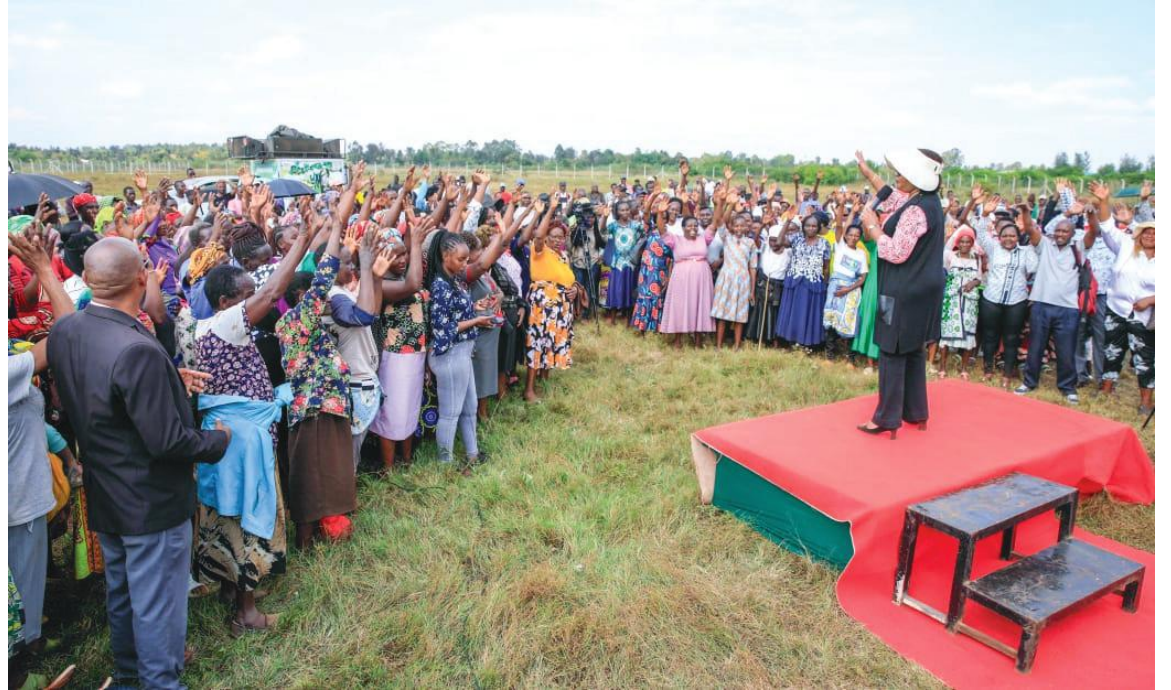
Governor Anne Waiguru addressing one of the meetings.

On the other hand, the site handover for the Sagana Affordable Housing Project will pave way for the construction of 487 modern homes that will be built in Phase One of the National Affordable Housing pro-