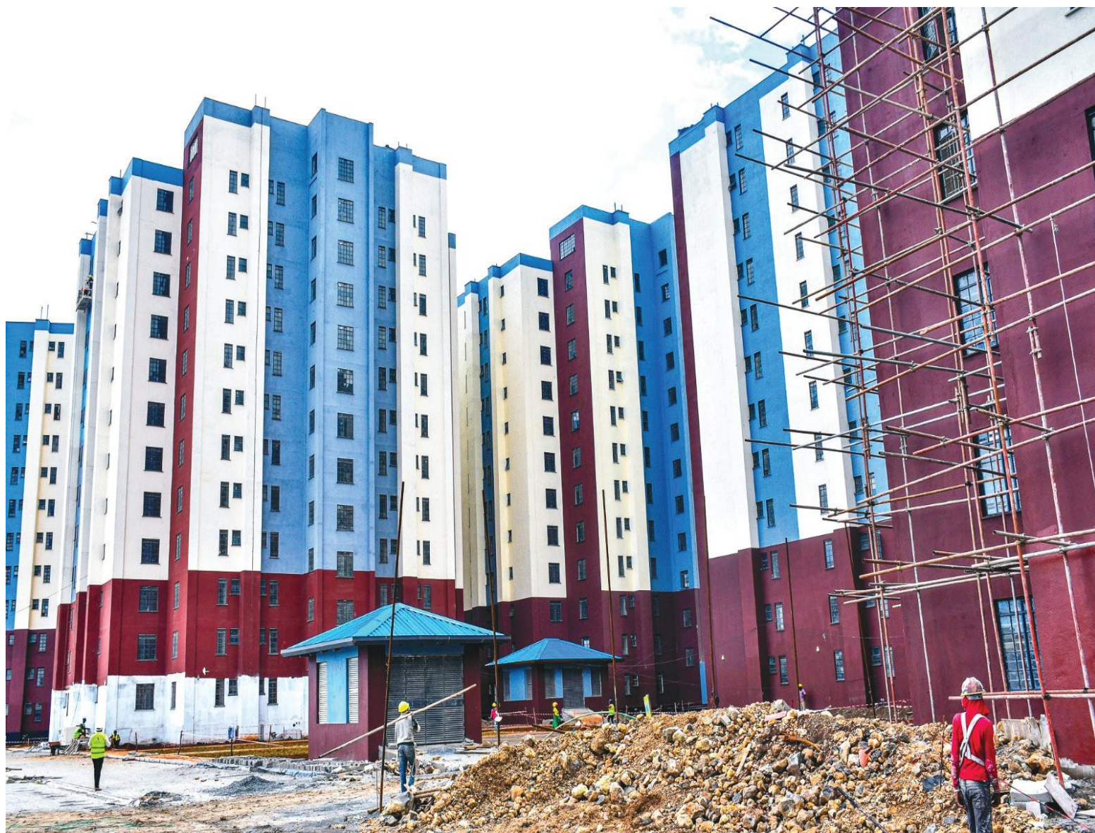
The Mukuru social housing project in Nairobi.