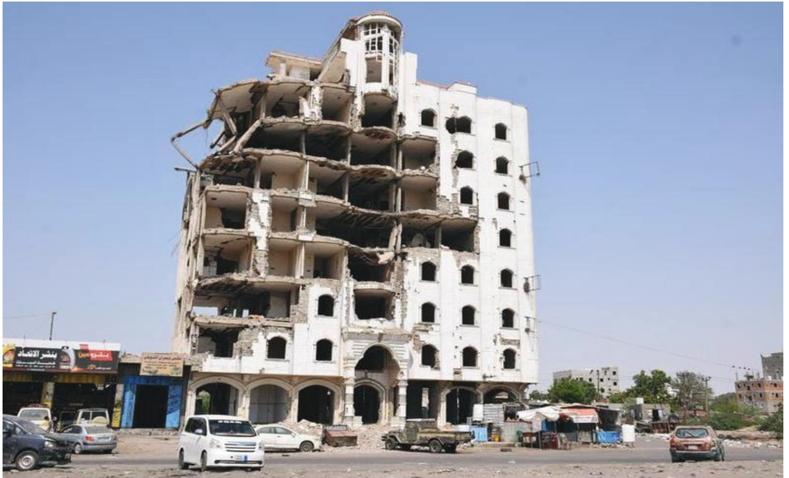
Youths in bicycle courier service business wait for calls from clients in Lusaka, Zambia.

The missile caused no casualties or damage. Again on Friday, a missile fired from Yemen landed in central Israel without causing casualties, according to the Israeli military and emergency services. Israeli media said the missile appeared to have fragmented in midair, with shrapnel falling near Ben Gurion Airport.