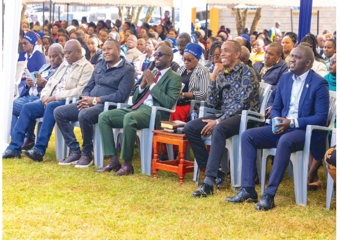
Kiambu Governor Kimani Wamatangi with some of the MCAs at Komothai PCEA in Githunguri constituency on Sunday..

He also asked the church to pray for him amid what he described as a political witch hunt, reaffirming that he would stay focused on service delivery and only engage in politics when the campaign season arrives.