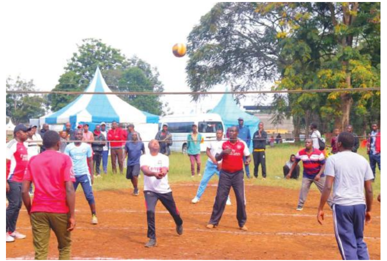
Teachers during the tournament

“Once our teachers are healthy, our children will be healthy too. Instead