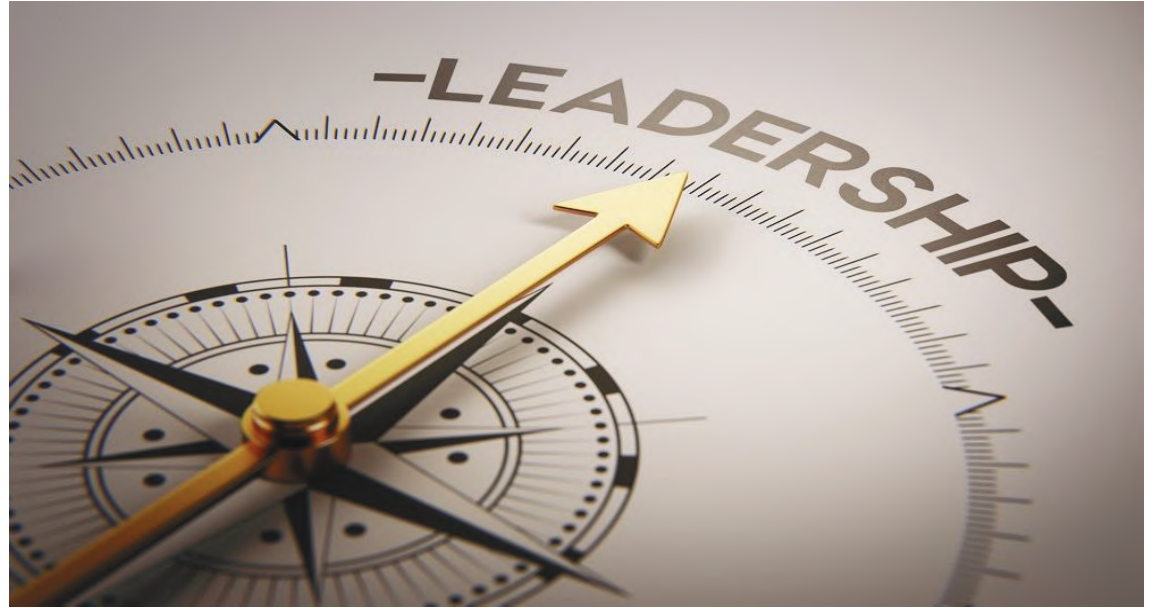
Table 1: The Competing vs. Fighting Framework