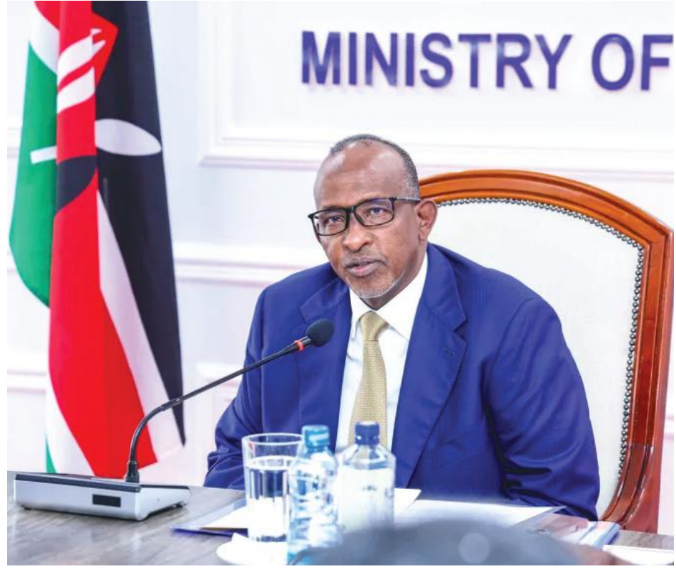
Health CS Aden Duale during a media briefing yesterday on health reforms and his war on corruption

Kenya's health sector has been haunted by corruption for decades. From billion-shilling procurement scandals at Afya House, to ghost hospitals and fake claims draining public coffers, billions meant to save lives have instead lined the pockets of cartels. For ordinary Kenyans, the corruption is not just numbers, it's empty medicine shelves, abandoned clinics, and patients dying because they cannot afford care.