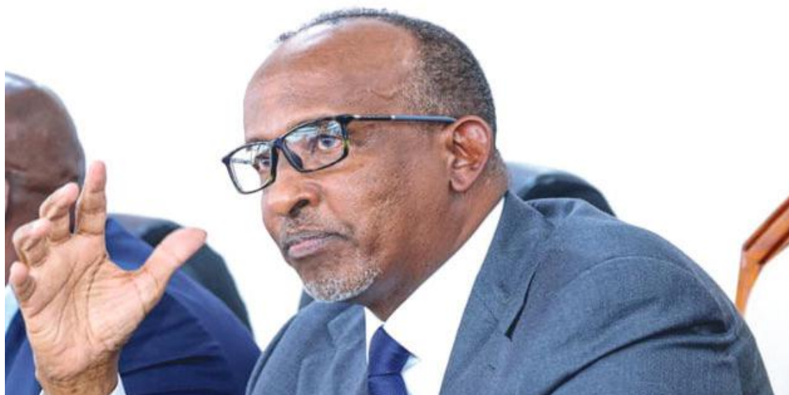
Health CS Aden Duale during a media briefing yesterday on health reforms and his war on corruption

The Rural Private Hospitals Association of Kenya (RUPHA) fired a