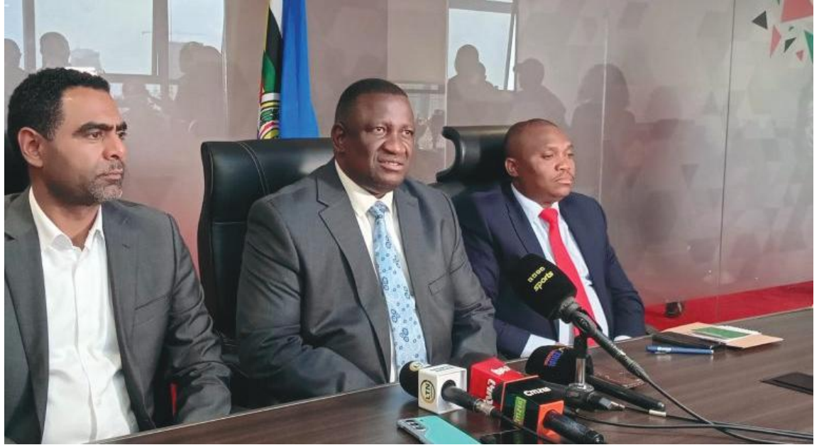
Cabinet Secretary for Youth Affairs, Creative Economy and Sports, Salim Mvurya alongside FKF officials issuing his address to the media

He also urged Kenyans to maintain the same spirit, stressing that continued discipline could open the door to a full-capacity stadium in future matches. “This is good news to Kenyans. We want to reiterate that we