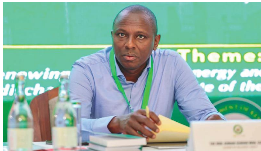
National Assembly Majority leader Kimani Ichung'wa