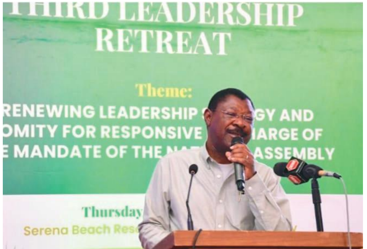
Speaker of the National Assembly, Moses Wetang'ula

"A committee is as effective as its leader. It is paramount as chairpersons to ensure that whenever any oth-