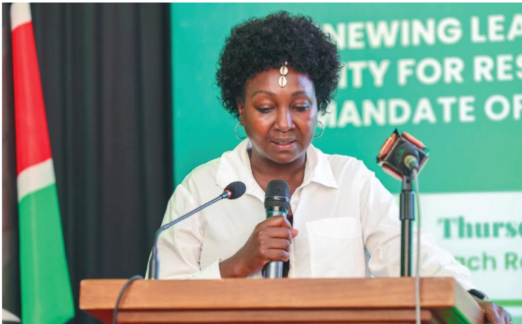
Deputy Speaker of the National Assembly Gladys Boss

She commended Members contributions during the deliberation of the Constitution of Kenya (Amendment) Bill, 2025. “The passage of the Bill in the National Assembly is a significant achievement for the House. The proposed entrenchment of the National Government Constituencies Development Fund (NG-CDF), the Senate Oversight Fund, and the National Government Affirmative Action Fund reinforces our dedication to equitable resource sharing and devolution in practice. In addition, public consultations nationwide demonstrated overwhelming support,” she pointed out.