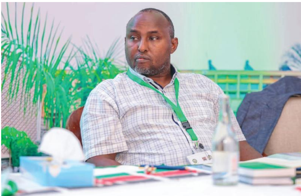
National Assembly Minority leader Junet Mohamed