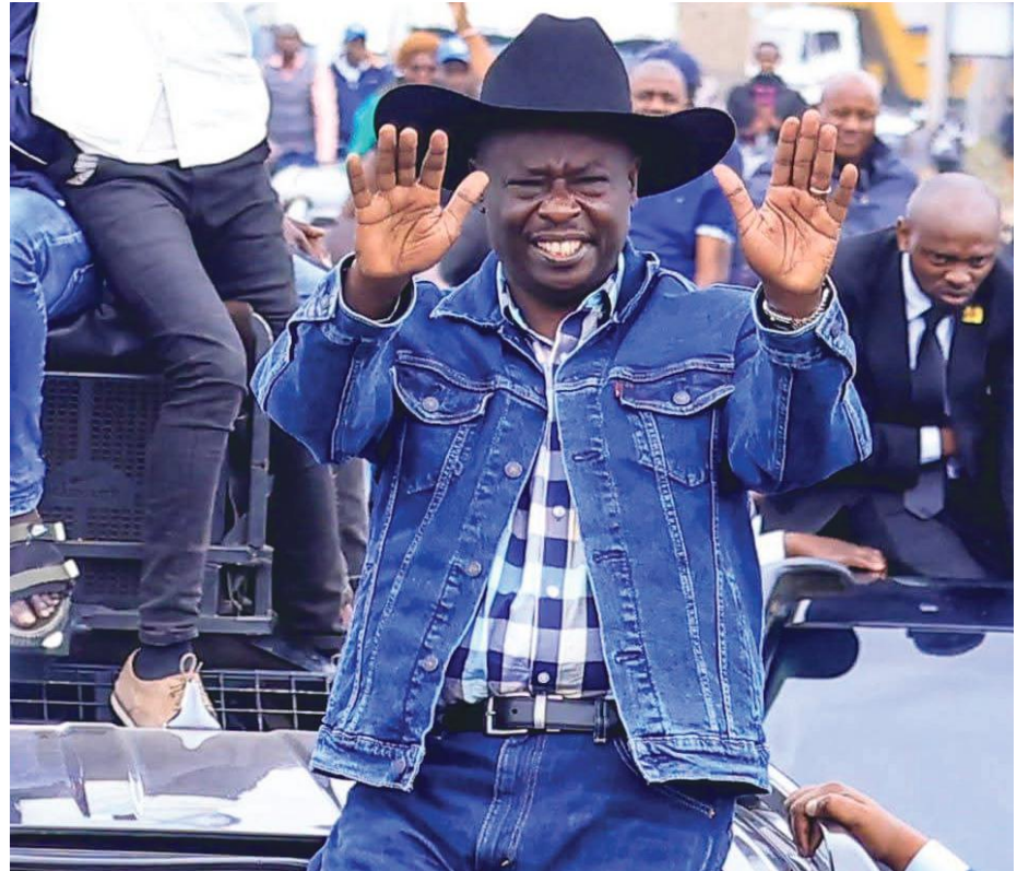
Former Deputy President Rigathi Gachagua

“Thank you, my great people of Kenya, for the love. I am happy to be back home,” he posted. Contrary to expectations that he would speak at Kamkunji grounds, Gachagua’s convoy did not make it to the venue.