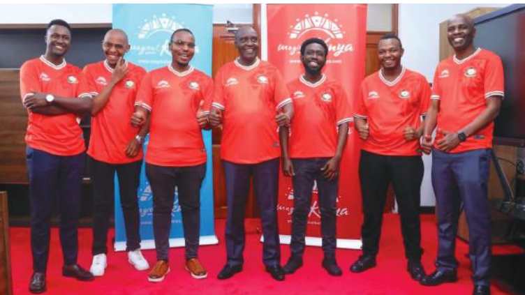
The Principal Secretary for the State Department of Tourism, Hon. John Ololua yesterday rewarded six winners of the MagicalKenya online trivia with official Harambee Stars jerseys. The initiative was part of the Ministry's campaign to rally nationwide support for the Harambee Stars while spotlighting Kenya as a leading sports tourism destination. Welcoming all visitors currently in the country for the ongoing sports events, the PS invited them to explore Kenya's unmatched tourism offerings—from vibrant cities to breathtaking landscapes. He also urged all Kenyans to turn up at the stadia, follow the matches online, and tune in via TV and radio to support our national team. Present at the award ceremony were the Acting CEO of Kenya Tourism Board, Mr. Allan Njoroge, alongside officials from the Ministry and KTB. Let's stand united behind the Harambee Stars—Tukutane Uwanjani, Mitandaoni, Redioni na Runingani!