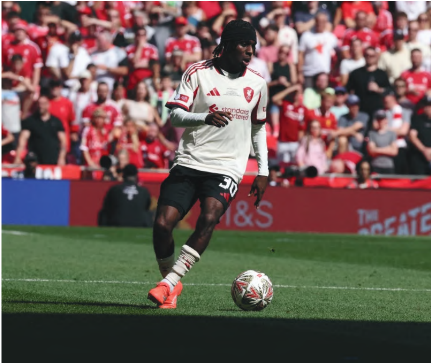
Liverpool's Jeremie Frimpong plays during the FA Community Shield match between Crystal Palace and Liverpool at Wembley Stadium in London, England, on August 10, 2025.

Liverpool defender Jeremie Frimpong faces several weeks out of action with a hamstring injury, Reds manager Arne Slot said yesterday.