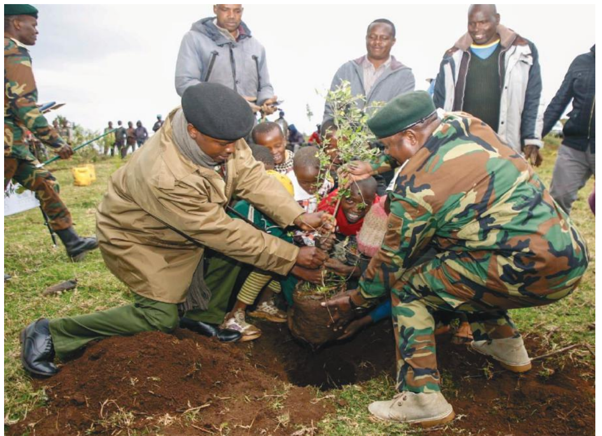
Kenya Forest Service Chief Conservator Alex Lemarkoko signs to launch the tree planting exercise at KFS headquarters in Karura, Nairobi.

Not only in the forests, the KFS urges stakeholders to plant trees at their homes, public places and within institutions since they were tracking the trees planted using the jaza miti app so as to track the progress.