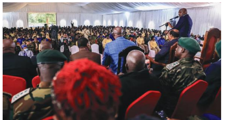
CS Kipchumba Murkomen addressing the Jukwaa La Usalama in Nyeri yesterday