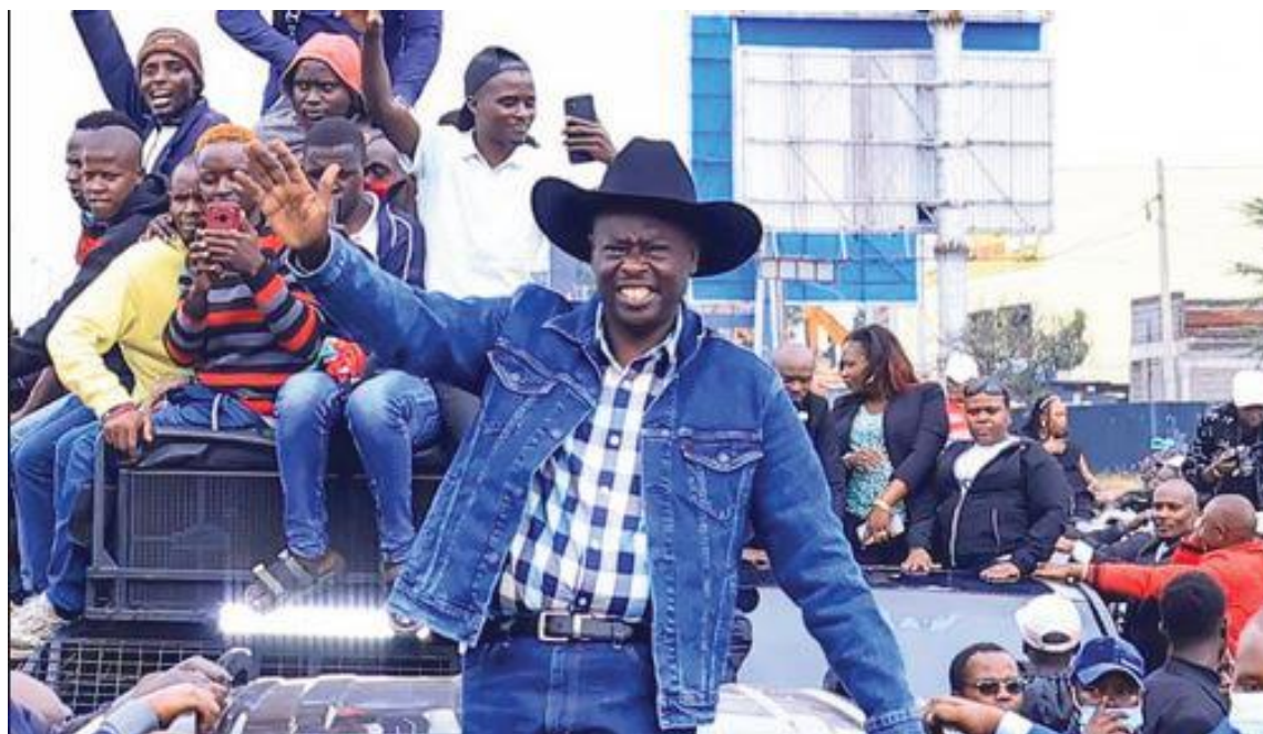
Former Deputy President Rigathi Gachagua

amid controversy over remarks he made during his American tour.