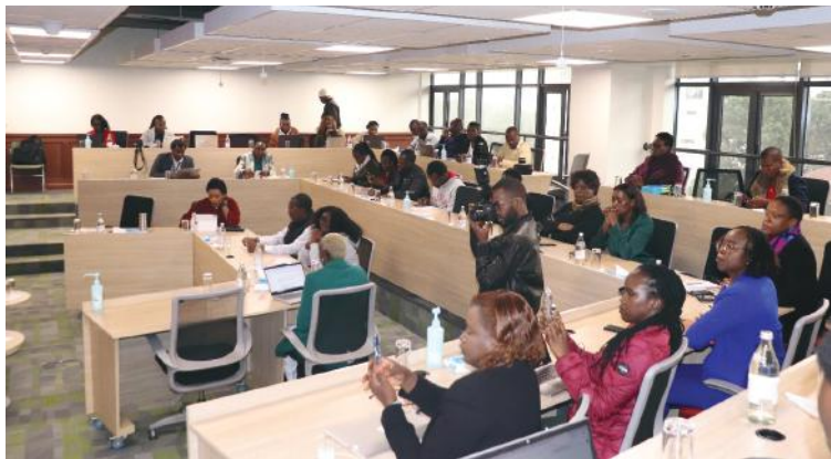
Sexual Harassment in the Media Industry dialogue at the Aga Khan University in Nairobi.

Speakers highlighted the need for clear reporting channels, stronger