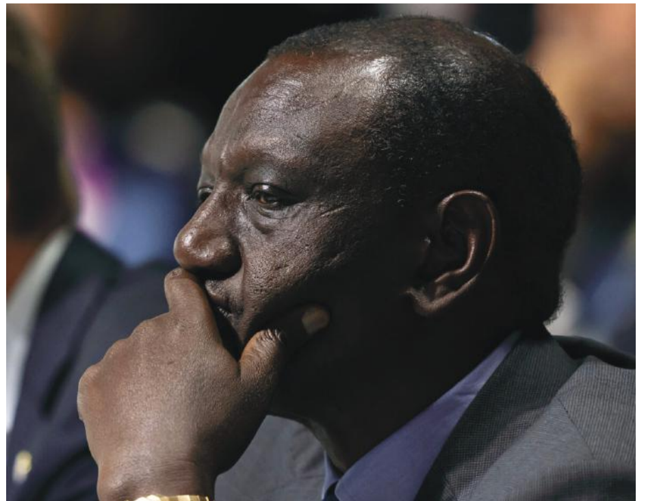
President William Ruto