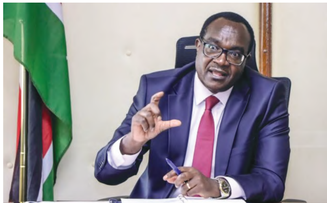
Education Cabinet Secretary Julius Ogamba

The announcement comes as thousands of students prepare for the start of the new semester amid rising concerns over the cost of higher education and living expenses.