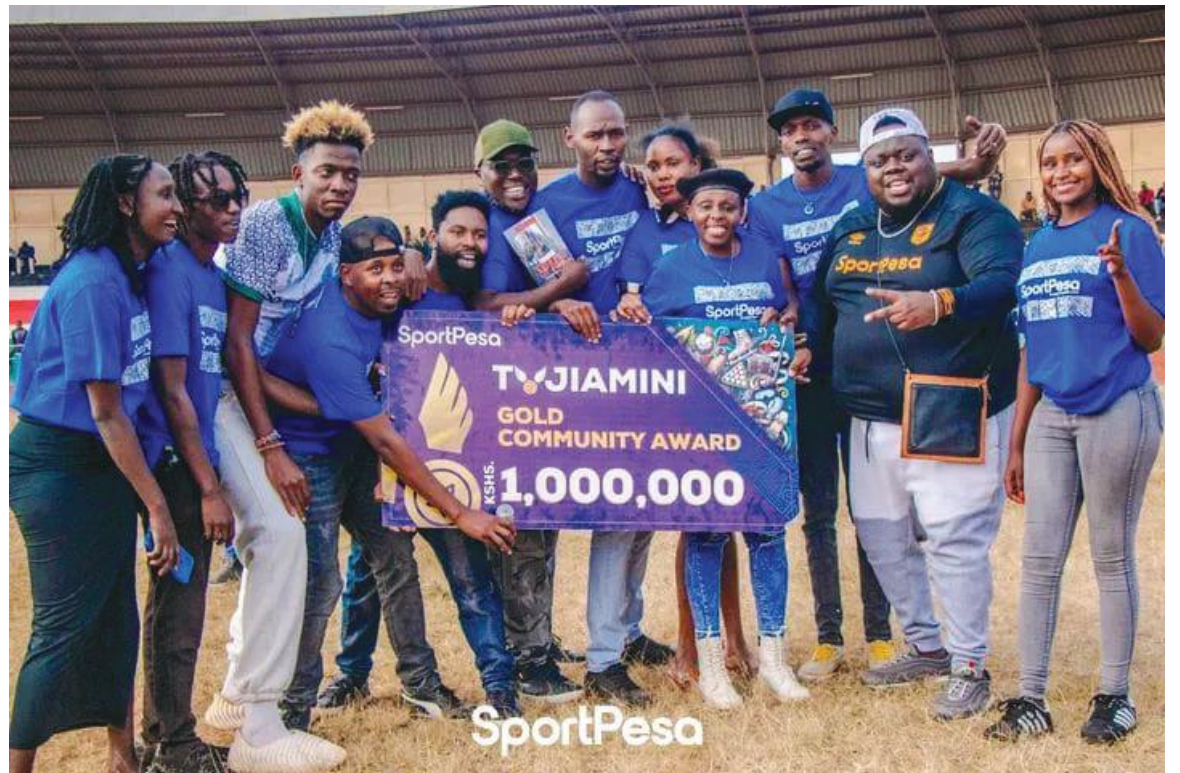
Maua artists with a dummy cheque from SportPesa after they won KSh1 Million for their studio.

lenges pushing their content to be played, especially on the national platform because of their low quality.