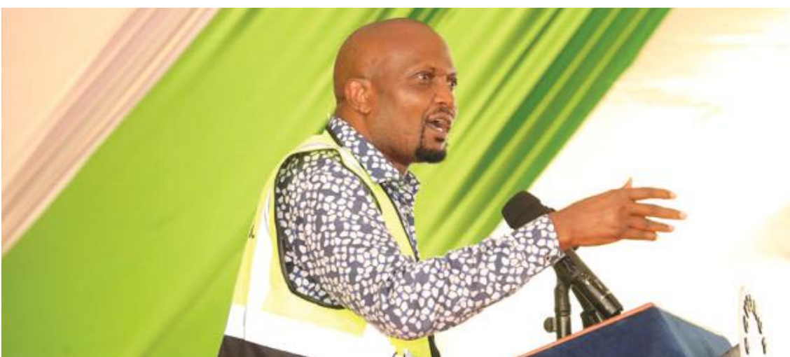
Former Presidential Economic Advisor Moses Kuria

Wiper Party leader Kalonzo Musyoka and Majority Leader Kimani Ichung'wah, was launched in 2023 to resolve political tensions after months of opposition-led protests.