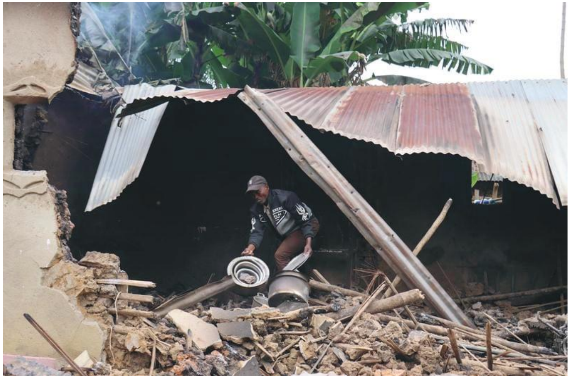
This photo taken on Aug. 17, 2025 shows the debris at the town of Oicha in Beni territory of North Kivu Province, the Democratic Republic of the Congo (DRC). According to local and military authorities, more than 50 civilians were killed between Thursday and Sunday in a series of attacks blamed on the ADF rebels in the Lubero and Beni territories of North Kivu.