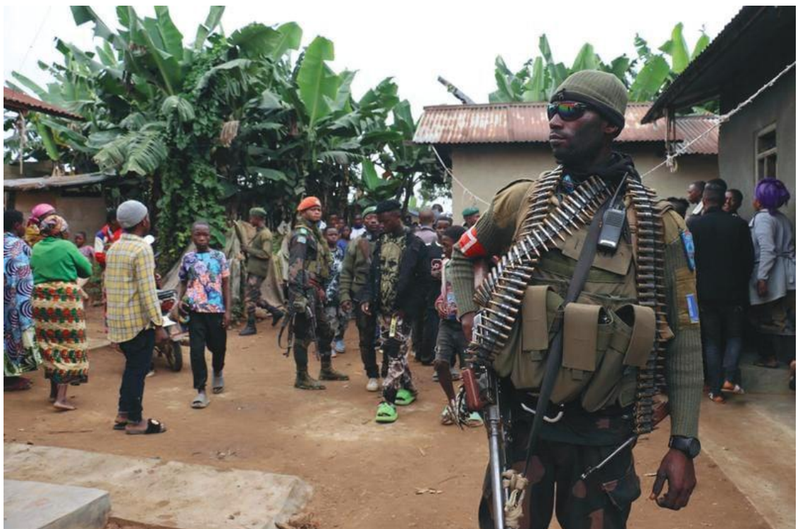
A soldier stands guard at the town of Oicha in Beni territory of North Kivu Province, the Democratic Republic of the Congo (DRC), on Aug. 17, 2025. According to local and military authorities, more than 50 civilians were killed between Thursday and Sunday in a series of attacks blamed on the ADF rebels in the Lubero and Beni territories of North Kivu.