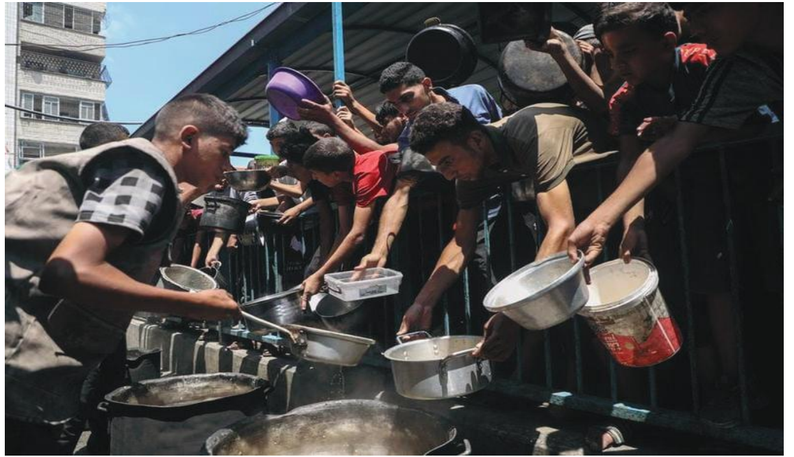
Displaced Palestinians wait to receive free food at a distribution center in Gaza City, on Aug. 18, 2025.

These are not natural disasters -- they are deliberate acts of human destruction. Modern warfare does more than kill. It systematically erases the foundations of survival. Hospitals, schools, water sources and power grids are not collateral damage -- they are targets, ensuring that violence begets famine, disease and generational ruin. Blockades turn siege into slow death. In Gaza, Sudan and Yemen, restrictions on food, fuel and medicine have pushed civilians toward starvation. The United Nations calls these acts illegal. Even humanitarian aid, the last thread of hope, has been weaponized. In Gaza, the Gaza Humanitarian Foundation, backed by Israel and the United States, has sidelined UN agencies as primary aid distributors. Meanwhile, the UN human rights office reported that since late May, around 1,800 people have been killed while seeking aid. Israel has disputed the figures, and the foundation has denied culpability. However, the truth is plain: humanitarian work is now a battleground.