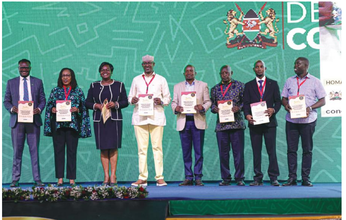
Deputy President Prof Kithure Kindiki with Council of Governors delegates officials.

Prof. Kindiki hailed devolution as the most profound innovation in the 2010 Constitution, adding that its milestones over the past 12 years validate its importance.