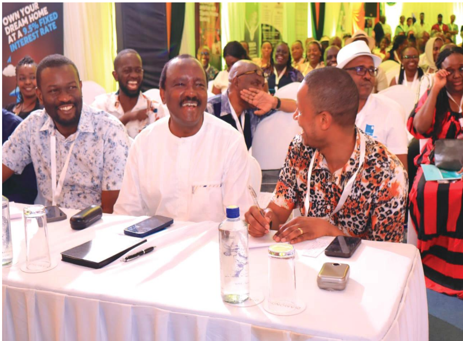
Wiper leader Kalonzo musyoka at the Law society of Kenya annual conference in Coastal region

Passionate calls for the protection of constitutionalism and the rule of law echoed through the annual conference of the Law Society of Kenya (LSK), as former Vice President Dr. Stephen Kalonzo Musyoka, a seasoned advocate with 46 years of legal practice, addressed judges, lawyers, and dignitaries on the pressing state of national affairs.