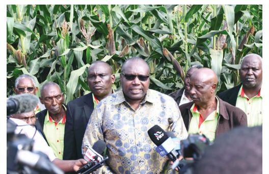
News: All Is Set For Central Kenya National Show Next Month In Nyeri P.12