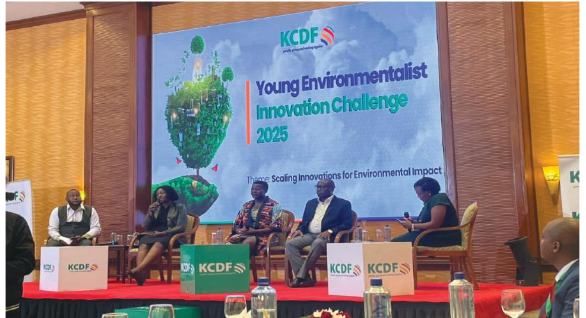
Different panelists at the Young Environmentalist Innovation Challenge 2025