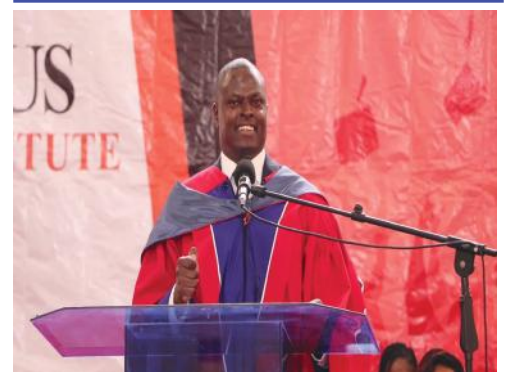
News: Ndindi Nyoro Tells Government To Release Capitation Arrears To Schools Ahead Of Third Term Reopening P.13