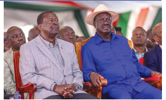
Politics: Mudavadi: Devolution Must Embrace The Aspirations Of The Youth P.11