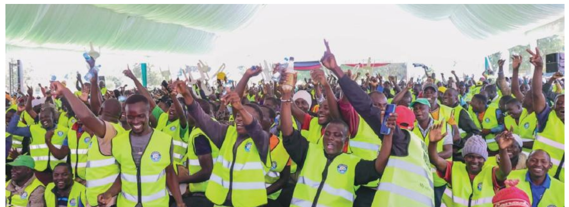
Some of the boda boda operators

The Prime CS has affirmed to continue with similar engagements moving into the UDA primaries and the November by-election.