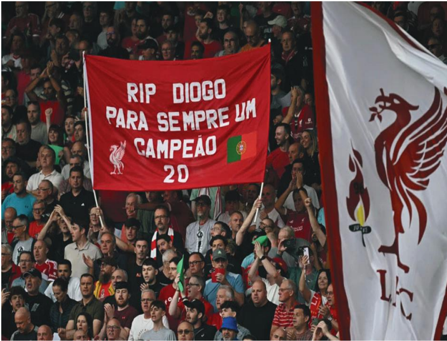
Liverpool's fans hold up a banner to pay tribute to Liverpool's late Portuguese forward Diogo Jota who passed away in a car crash ahead of the English Premier League football match between Liverpool and Bournemouth at Anfield in Liverpool, north west England on August 15, 2025.