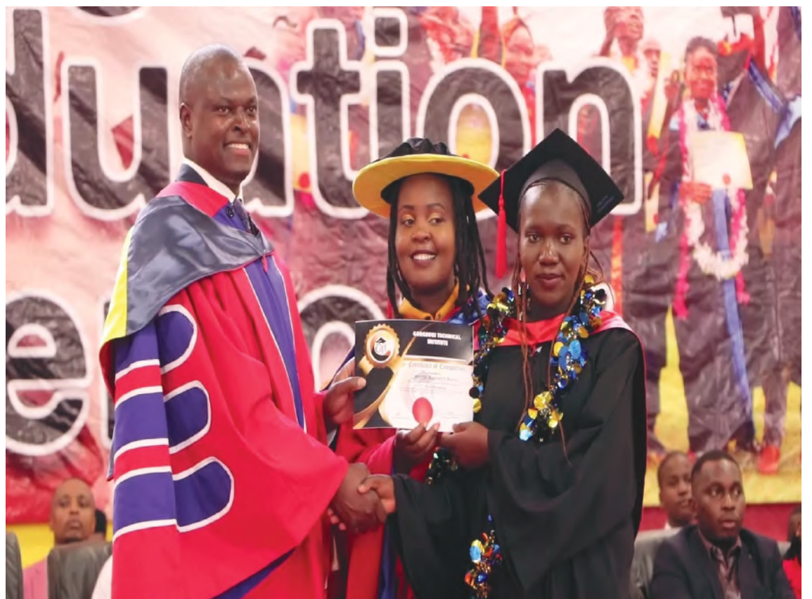
Kiharu MP Ndindi Nyoro presenting a certificate to a grandaunt at the 5th graduation ceremony of Gorgeous Technical Institute in Thika Town.

Hospitality, Masonry, Plumbing, Tailoring, Hair Dressing, Baking Technology among others.