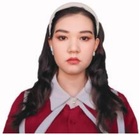
By: Urazalieva Sarvinoz Saidahmadovna