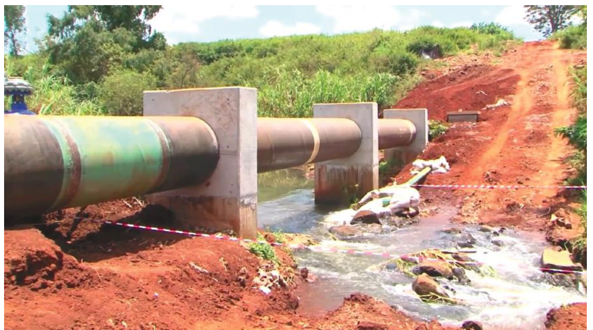
The Northern Collector Tunnel (NCT) project pipeline in Gatundu South..

AWWDA also plans to achieve 60% access to sewer sanitation coverage in its area of jurisdiction through expansion of wastewater treatment capacities by 138,000m 3 /day and expanding sewer networks by 680km.