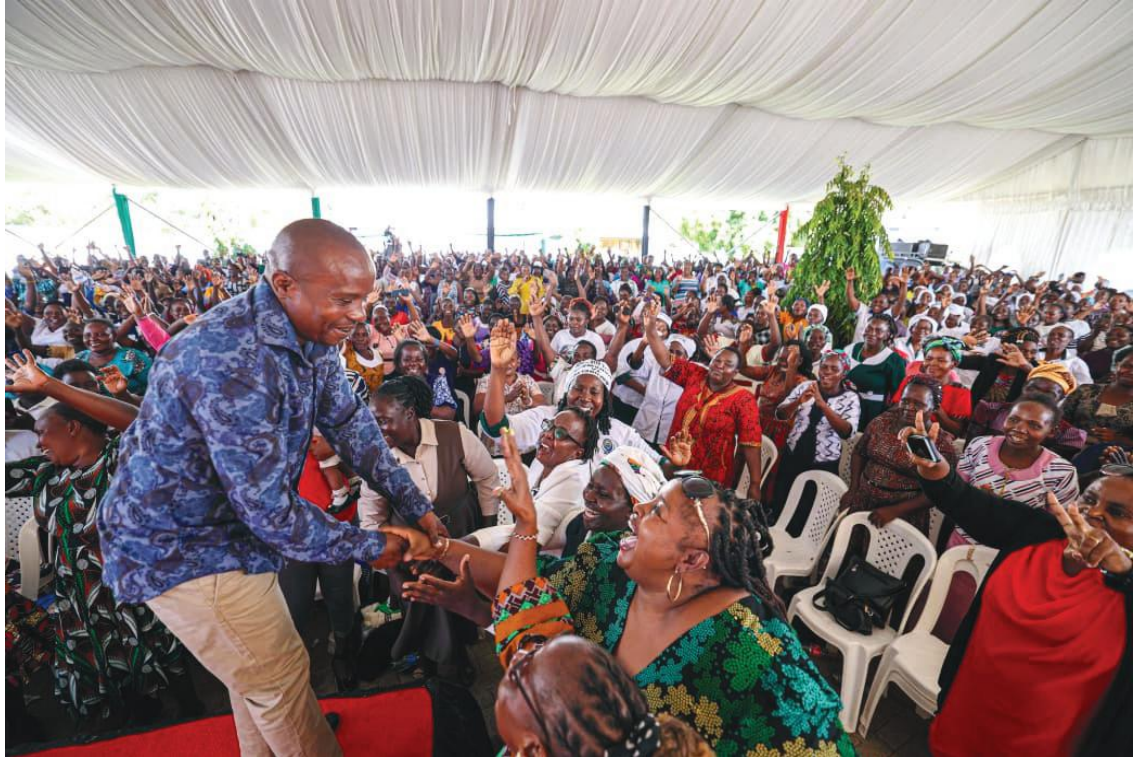
Deputy President Prof Kithure Kindiki greeting some of the delegates..

The county has also received an increased allocation of Sh.1.2 billion