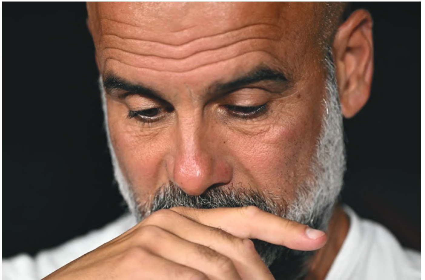
Manchester City's Spanish head coach Pep Guardiola gestures ahead of the FIFA Club World Cup 2025 round of 16 football match between England's Manchester City and Saudi's Al-Hilal at the Camping World stadium in Orlando on June 30, 2025. Manchester City, which has amassed championships, domestic cups and even a Champions League title over the last decade, ended last season without any trophies. As Pep Guardiola enters his tenth season, can he lead the club back to success?

Premier League chief executive Richard Masters said his "frustration" at waiting for a verdict in a series of financial charges against Manchester City is irrelevant as the case is in the hands of an independent hearing. The Premier League issued more than 100 charges against City in February 2023 related to alleged breaches of its financial rules and with allegedly failing to co-operate with the subsequent investigation. The case was heard by a commission between September and December last year but no decision has been published. The issue continues to hang over the league as the 2025/26 season gets underway this weekend, but