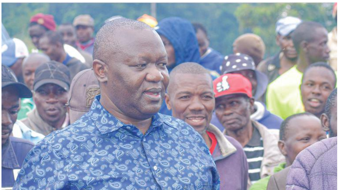
Kisumu Senator Tom Ojienda

accusing the two leaders of politicising "a noble effort" to heal the nation and urging them to propose constructive solutions instead in a response on Sunday.