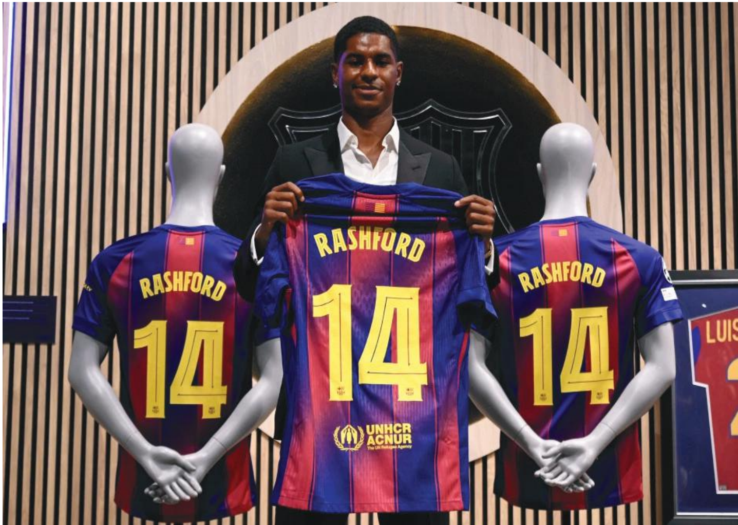
English forward Marcus Rashford who joined Barcelona on loan from Manchester United holds up his jersey during his official presentation at the Camp Nou stadium in Barcelona on July 23, 2025. Barcelona and Manchester United have reached a deal for the loan of the player Marcus Rashford until June 30, 2026," announced the La Liga champions in a statement.

Marcus Rashford decried Manchester United's lack of strategy is leaving the English giants in "no man's land" after joining Barcelona on loan. The 27-year-old, who played 426 times for United after coming through the club's academy, left Old Trafford in January for a loan spell at Aston Villa after falling out of favour with new manager Ruben Amorim. United went on to have their worst season since being relegated in 1973/74 as they finished 15th in the Premier League and failed to qualify for European competition. "We have been way below where we deem United to be but then if you take a step back, which I've