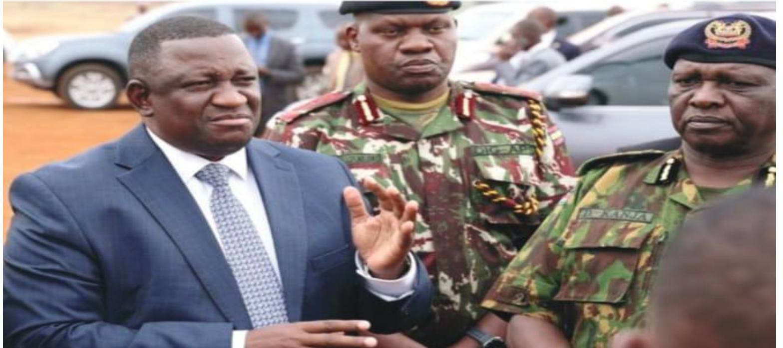
CS Salim Mvurya briefing journalists as police officers led by IG Douglas Kanja listens.

• Further, the CS lauded Kenyans for their unwavering support of the national team, urging them to pair their passion with discipline and adherence to tournament protocols.