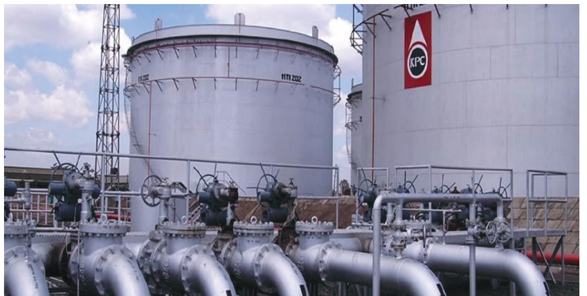
A Kenya Pipeline Corporation plant.

The government has defended the plan, citing a cash crunch and the need to raise Ksh.149 billion for the 2025/26 budget to fund development projects and clear pending bills