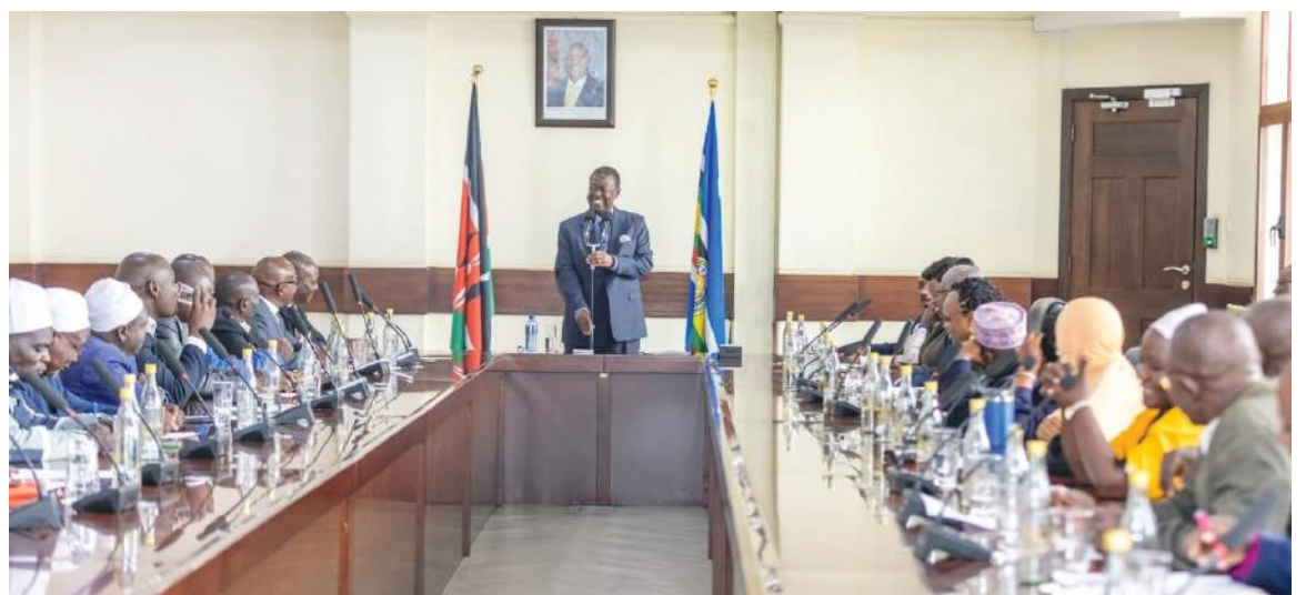
Prime Cabinet Secretary Musalia Mudavadi with the religious leaders yesterday.

This is among many other engagements that Mudavadi has held with various stakeholders from Malava Constituency, and he has affirmed that the same will continue for the rest of Western Kenya moving forward.