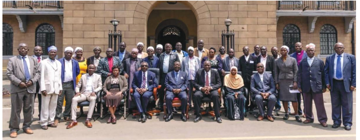
Prime Cabinet Secretary Musalia Mudavadi with the religious leaders yesterday.

“I have not met you to try and force anything or anybody on you and the people of Malava. The people will have to make a conscious decision on the leader they want and whom they