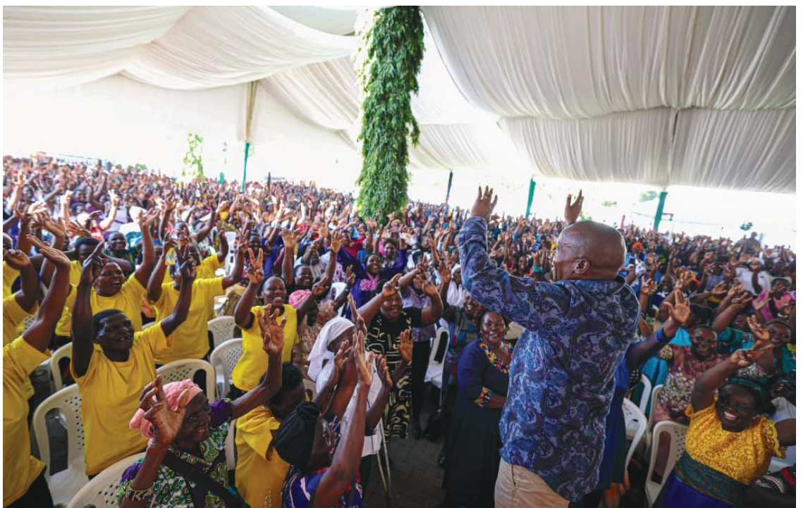
Deputy President Prof Kithure Kindiki addressing the meeting.