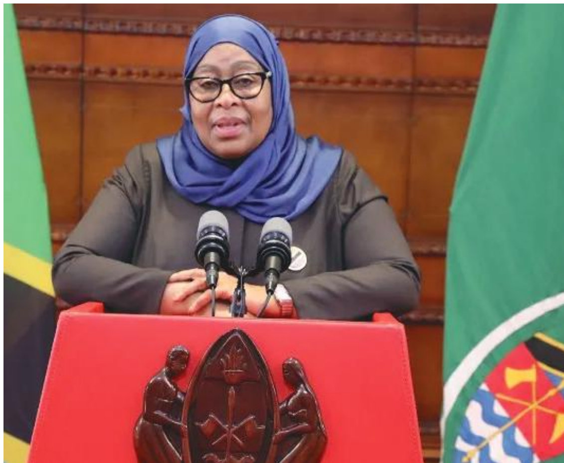
United Republic of Tanzania President Samia Suluhu