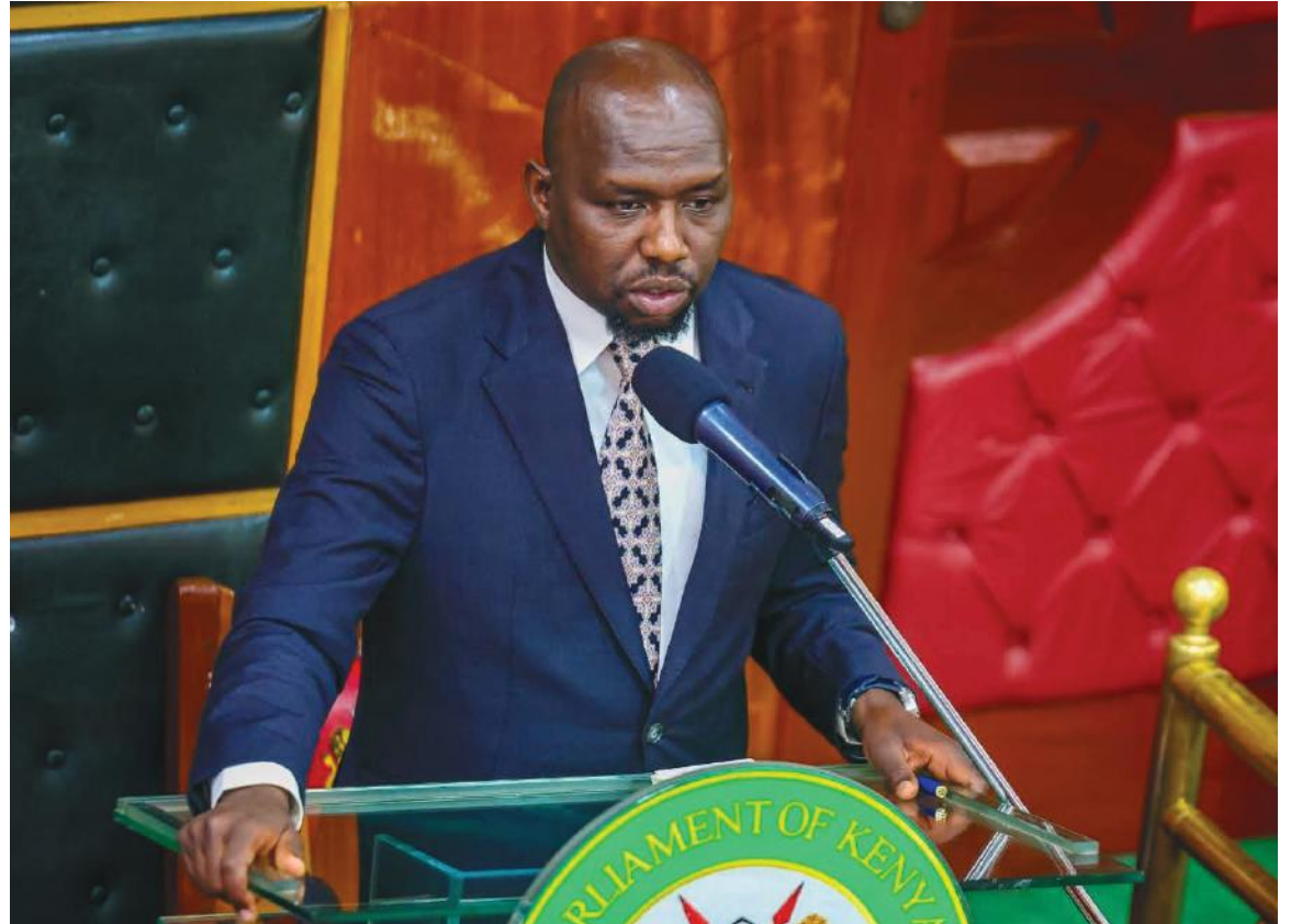
Cabinet Secretary Kipchumba Murkomen in the National Assembly yesterday.

He named several individuals featured in the documentary, adding that fourteen witnesses have so far been