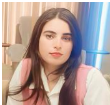
By: Anila Bukhari @themkenyatimes