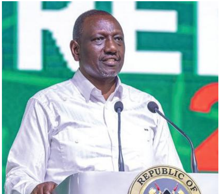
President William Ruto At The 9th Devolution Conference

President William Ruto has castigated a section of Members of Parliament whom he claims have been demanding bribes to alter or ignore official reports. The issue came up during the opening ceremony of the Devolution Conference in Homa Bay County, where the President singled out members of House Oversight Committees for allegedly using sessions to extort money from guests appearing to respond to audit or budgetary queries.