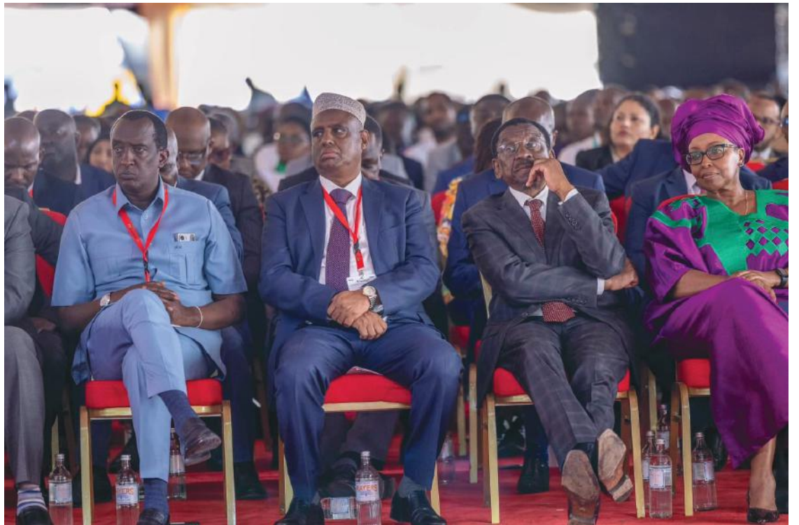
Governors at the 2025 Devolution Conference

Devolution can still deliver equity, inclusion and justice but only if integrity stops being optional. Kenya cannot afford another decade where corruption remains the biggest beneficiary of devolution.